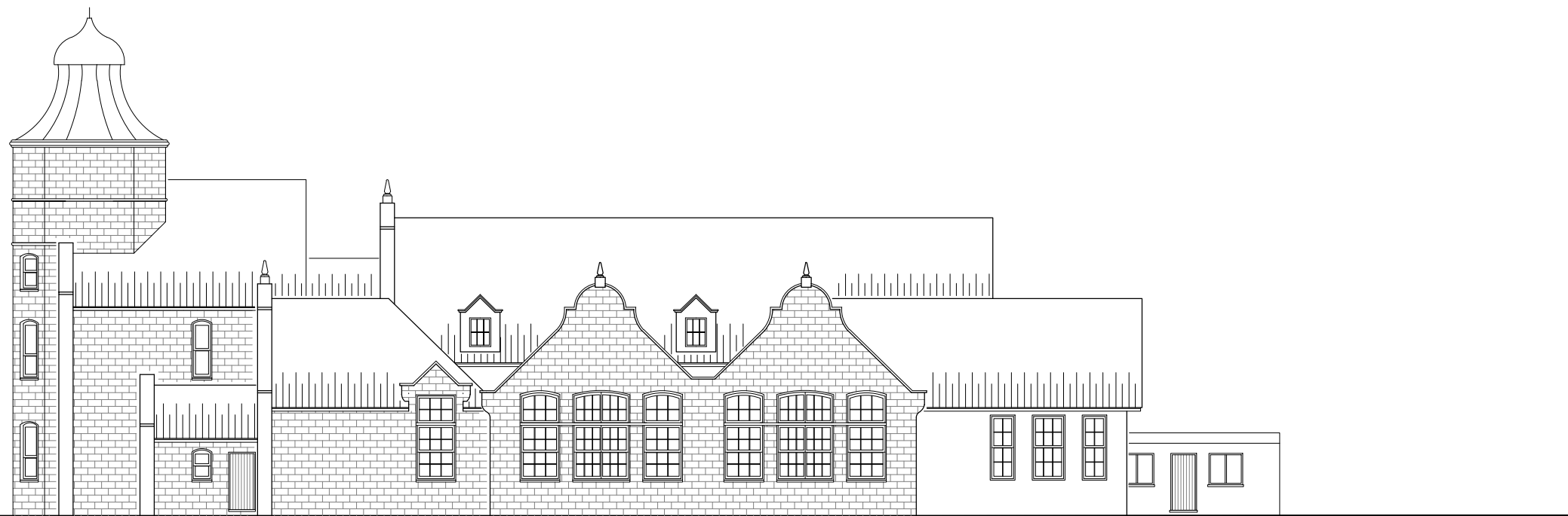
SIDE ELEVATION (B) (NO:01 MAIN BUILDING)